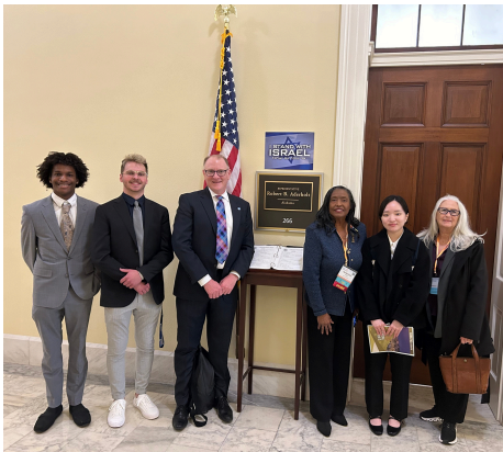
Advocacy Visit to Congressman Robert Aderholt's Office

During the Advocacy breakfast on Capitol Hill, GTA's team had the opportunity to engage with new Congressional and Department of State personnel and initiate connections with CBM associates. The meeting's plenaries and workshops were dynamic, filled with valuable insights, and marked by a sense of celebration.