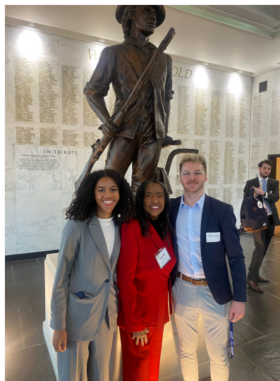
Advocacy Day on the Hill